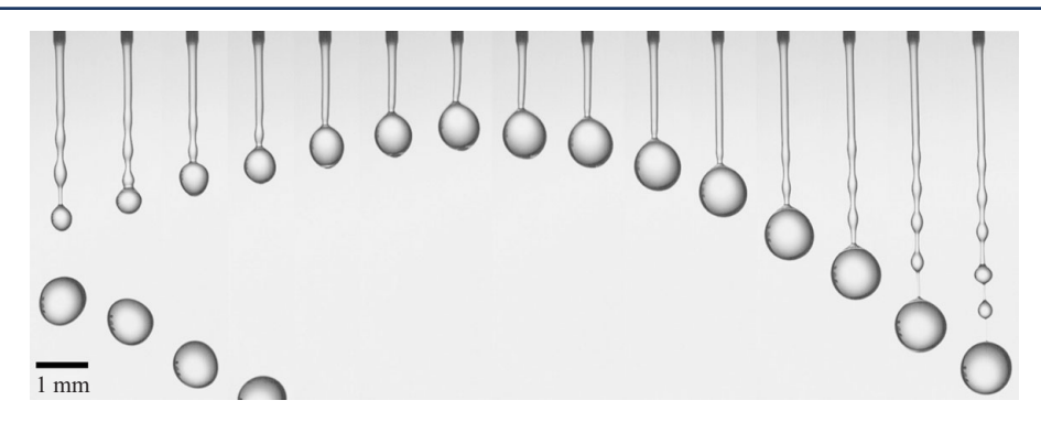
FIGURE 1. The 'gobbling' phenomenon: a large terminal drop periodically develops at the end of a thin jet of a viscoelastic fluid (100 p.p.m. of polyacrylamide in aqueous solution). The drop initially moves upward, 'gobbling' the thread, before detaching. The time interval between the images is 6 ms (figure from Clasen et al. 2009).